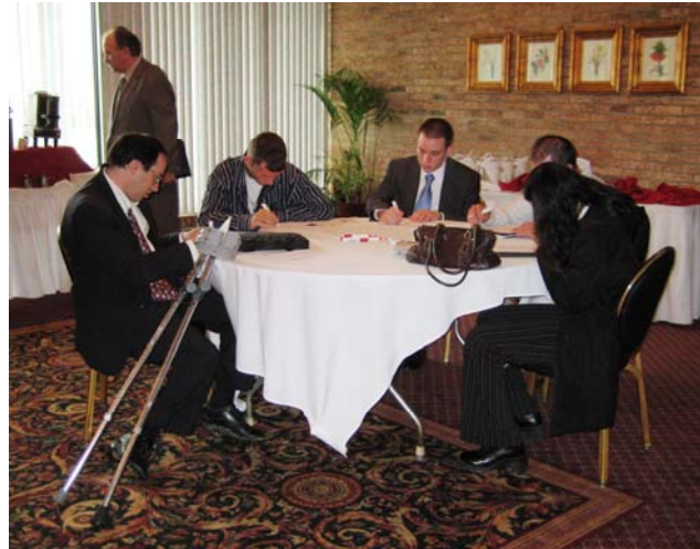
Job-seekers filling out registration forms prior to the fair.

Both job fairs were sponsored in part by the Manufacturing Education and Economic Network (M.E.E.N.) and the Workforce Investment Board.